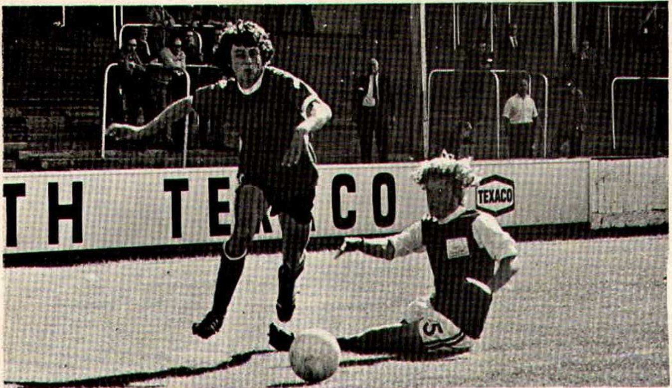
Two action shots from last Saturday's match at the County Ground, Swindon Town Reserves v Plymouth Argyle Reserves, which resulted in a good win for the home team.